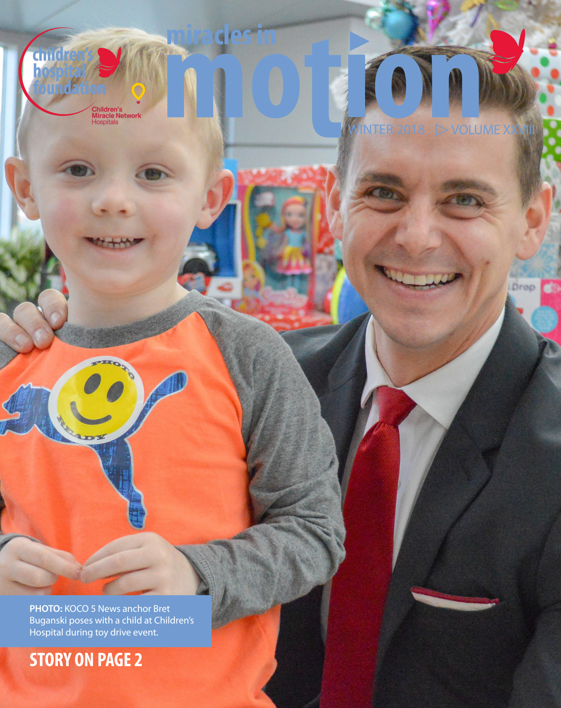
PHOTO: KOCO 5 News anchor Bret Buganski poses with a child at Children's Hospital during toy drive event.